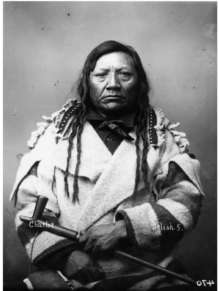
Słm̓x̓e Q̓ʷox̓ʷqeys (Claw of the Little Grizzly — Chief Charlo), portrait taken in Washington, D.C., 1884.

Just after Fort Missoula’s establishment, Chief Joseph and the non-treaty Nez Perce, pursued by the Army, moved east over Lolo Pass and approached the Bitterroot Valley. White settlers in Montana, the memory of the 1876 Little Bighorn battle fresh in their minds, frantically raised alarms about a supposed Salish alliance with the Nez Perce to exterminate all whites in the region. Słm̓x̓e Q̓ʷox̓ʷqeys, however, refused to ally with the Nez Perce, although they were the ancient allies and relations of the Salish. Słm̓x̓e Q̓ʷox̓ʷqeys warned the Nez Perce not to harm any whites, or the Salish would fight against them. He was trying to prevent further war — which would have probably been disastrous for the Salish — by forming a