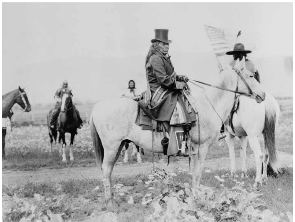
Below right: Słm̓xe Q̓w̓ox̓weys (Claw of the Little Grizzly — Chief Charlo), Arlee celebration, 1907.