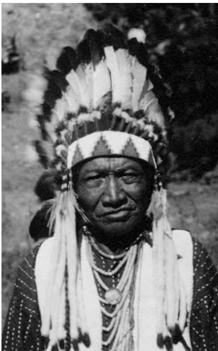
Above: Chief Martin Charlo during visit to Medicine Tree, 1923.

Słm̓xe Q̓w̓ox̓weys guided the Salish people through a perilous passage in tribal history, managing to assert the rights and sovereign status of the Salish while avoiding direct conflict. He tenaciously and courageously carried on the highly disciplined policy of non-violent resistance that had been established by his father, X̓w̓et̓x̓łcín. Despite the barriers of language and writing, Słm̓xe Q̓w̓ox̓weys dealt skillfully and forcefully with many officials, in Montana and in Washington, in advancing the cause of the Salish nation. Despite the forced removal of the Salish to the Flathead Reservation, Chief Charlo's long battle to stay in the Bitterroot Valley provided the foundation for the CSKT's fierce defense, and restrengthening, of their treaty rights and cultural survival in the twentieth century — and beyond.