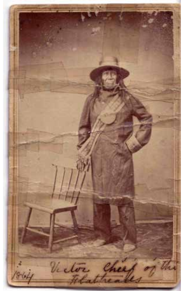
X̓w et̓x̓łcín (Many Horses — Chief Victor), 1864.